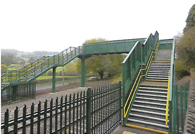
Image shows what the bridge could look like